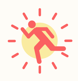
Patterns help Try to exercise at the same time of day, every day, so that it becomes a regular part of your schedule and lifestyle.