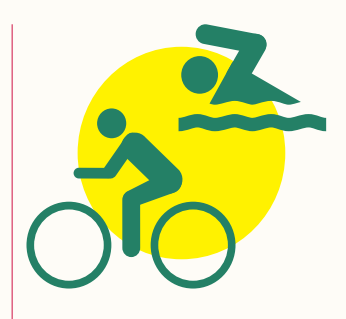
Mix things up Do a variety of activities or change up the scenery/location to stay interested.