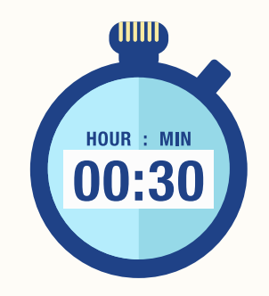
Start slow Give your body time to build up to 30 minutes a day (or whatever amount of time your doctor recommends).